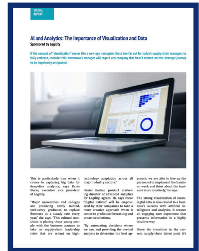
AI and Analytics: The Importance of Visualization and Data