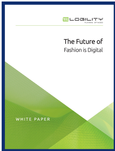
The Future of Fashion is Digital